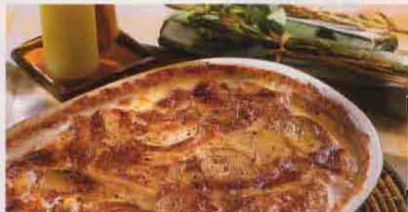
Gratin Potatoes is as easy as peel, slice, and bake.

BEAT remaining 2 cups cream at medium speed with an electric mixer until soft peaks form; fold cream into chocolate mixture. Pipe or spoon into a large serving bowl or dessert dishes. Garnish with additional whipped cream and grated chocolate, if desired. Chill 2 hours. ♦