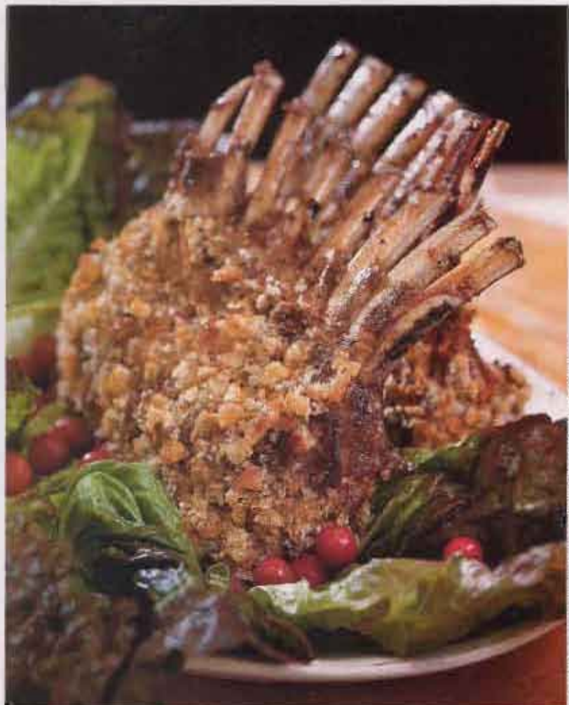
Succulent Dijon Rack of Lamb takes only six ingredients.