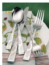
Oneida Tuscan Flatware