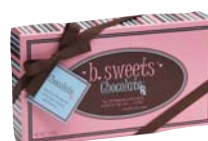
b. sweets chocolate