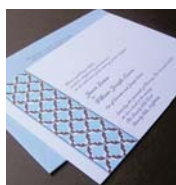
Little Tree Press