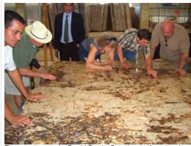
The group went to the Zucchi Granite Group's manufacturing plant where slabs are cut, sealed and polished.